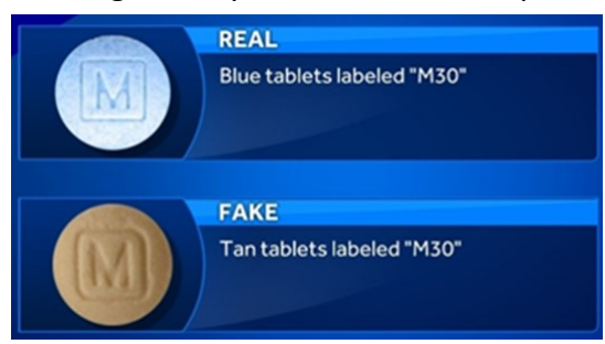
Authentic oxycodone tablet (top) and a counterfeit containing fentanyl (bottom)

chase a kilogram of fentanyl for $1,000-$2,000 and turn it into tablets sold for $100,000 on the street. Drug users often seek out prescription drugs for their known qualities and effects, so dealers have begun making counterfeit tablets. While the FDA controls the sale of pill presses domestically, many presses are being shipped from overseas. Many are confiscated by the U.S. Customs Service.